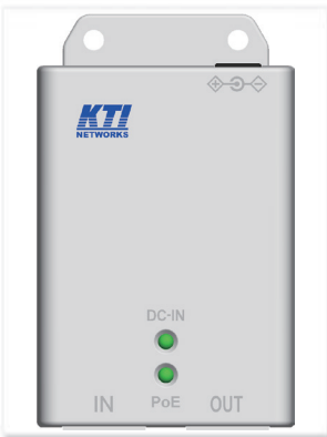
AC power adapter