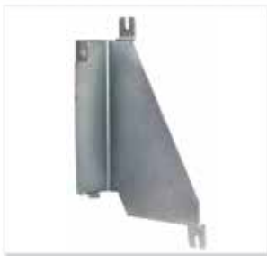
Panel Mounting Bracket KCD-3PB

The industrial KCD-300 media converter series provides industrial strength Ethernet copper-to-fiber media conversion, allowing for 10Base-T-100Base-FX or 100Base-TX-100Base-FX over multi-mode or optional single-mode fiber optical media.